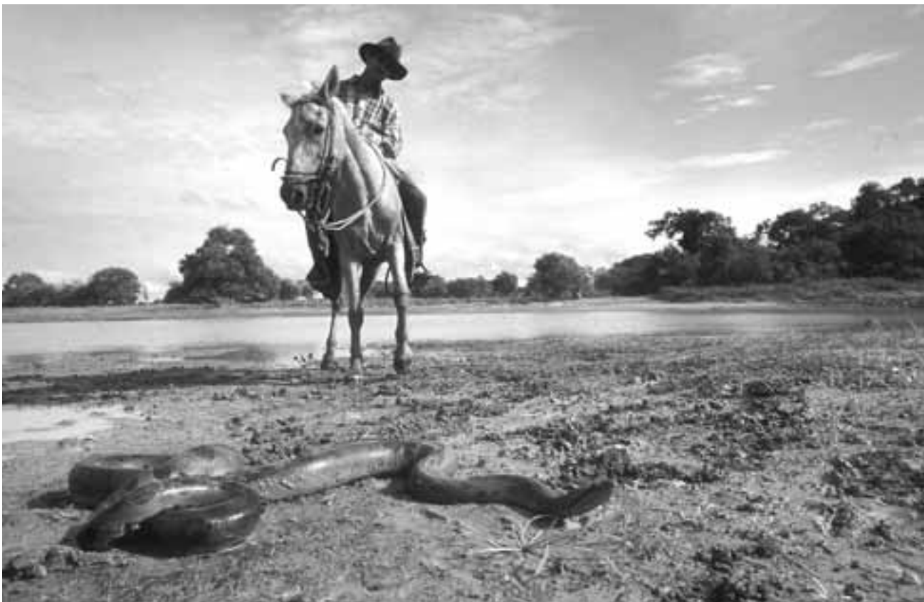
Much of the Venezuelan llanos is managed for cattle, with dikes used to hold water for the dry season. Consequently, encounters between cowboys and snakes occur frequently.

Management as a means of incorporating use of anacondas into economic development plans is difficult, and more research is needed. Harvesting males, as well as farming of neonates, are