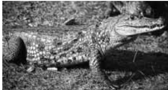
In 1986, the Venezuelan government initiated the harvest of Spectacled Caimans ( Caiman crocodilus ) on private lands.

breed of entrepreneur, whose business consisted of renting truckloads of rotting carcasses to crooked landowners. This is only one example of the many tricks that Profauna had to uncover in their effort to implement the program. Many of the people who were supposed to be involved in the management of a sustainable resource never perceived it as anything other than an ephemeral source of wealth. Consequently, this resulted in dramatic population declines in many areas (Thorbjarnarson and Velasco 1999). This program was unsuccessful not only because it failed to convince locals that it was a long-term program capable of providing sustained revenues, it also failed to provide adequate economic incentives to the local populace, who never saw the need to protect the resource.