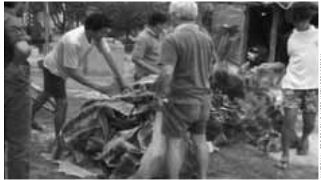
Bundling Green Anaconda skins for transport to the tanning plants.

The Argentinean program for harvesting Yellow Anacondas (see Box) also embraced a neoliberal agenda. During the late 1990s, economic growth had slowed and the nation was facing serious economic problems. By the end of 2001, the IMF pulled out and the economy crashed (Blustein 2005), rendering imperative the exploitation of a natural resource. Tanners in Formosa Province provided a fund of $100,000 for harvesting anacondas, a juicy contribution to a stagnant economy. The whole system depended on the urgent need to produce cash to ameliorate the